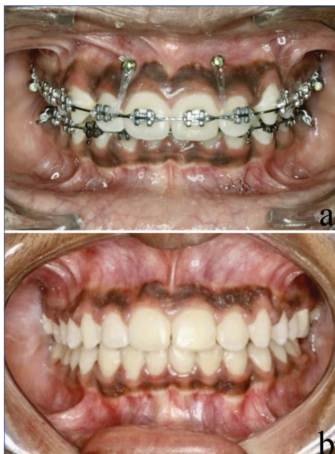
[Table/Fig-1]: (a) Beginning of intrusion and retraction with two mini implants placed bilaterally in maxillary anterior segment for intrusion; (b) Post-treatment.

Pre- and post-intrusion cephalograms were analysed using FACAD software (Version 3.11) for the assessment of upper incisor and maxillary molar positions. Two linear and one angular parameter were measured and recorded to assess the intrusion effects of incisors.